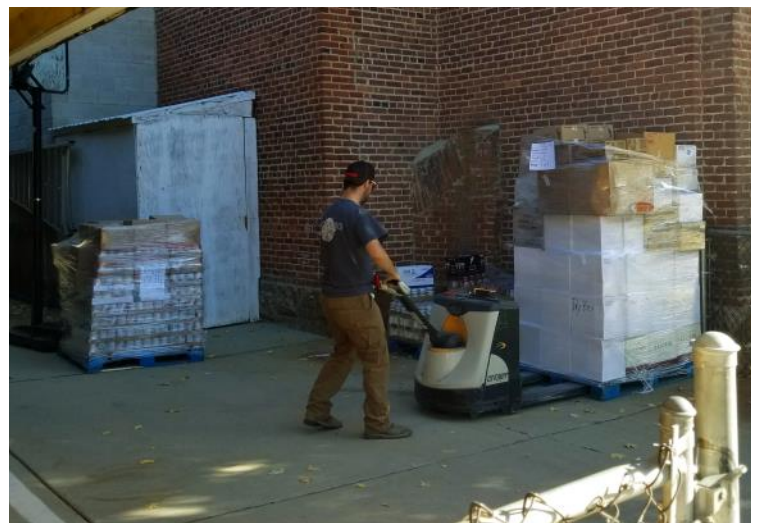
3 pallets of food delivered to our door means 4,500 pounds we did not have to lift in and out of pickup trucks!