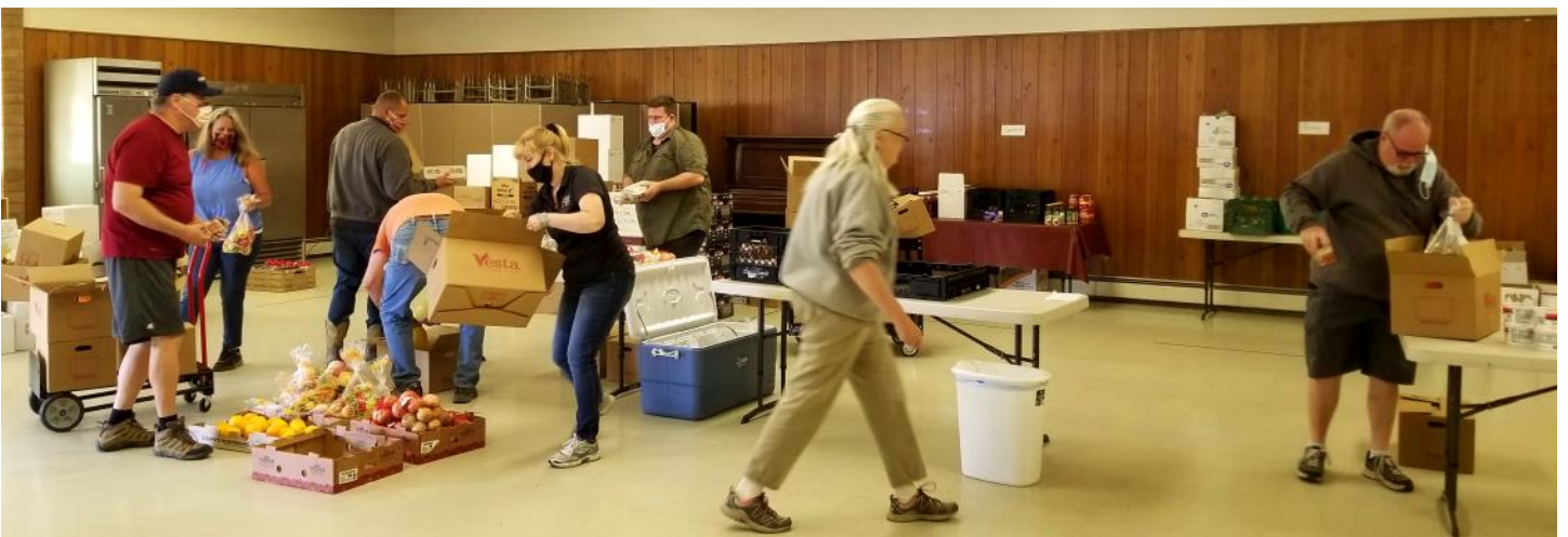
It's a blur of activity and flying empty boxes as our volunteers sort through the latest delivery before we open.