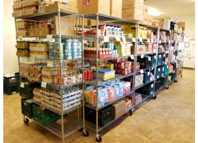
Mandy S. confirms our inventory and updates our shopping list just in time before our clients arrive.